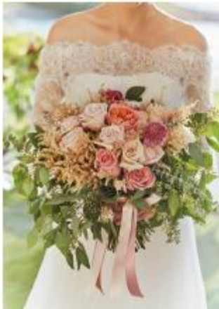
Baby Blush (HB-57) $800 Head Piece $175 Haku Lei $265