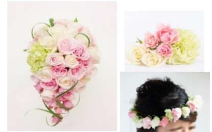
Pale Pink & Cream Cascade (WB-13) $465 Head Piece $130 Haku Lei $265