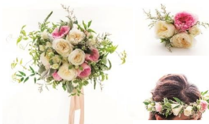
Shabby Elegance (WB-17) $ 530 Head Piece $200 Haku Lei $265