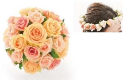
Peach Pastel Mix Rose Round (WB-26) $400 Head Piece $125 Haku Lei $250