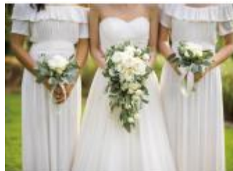
Bride's Maid Bouquet $105 Matching color for bride's bouquet Size: 6 inch /Style: Clutch ※Must purchase upgrade Bouquet