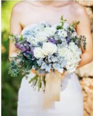
Seaside Rustic (HB-56) $690 Head Piece $175 Haku Lei $265