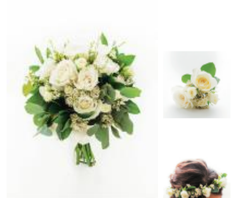
White Natural Clutch (WB-14) $630 Head Piece $140 Haku Lei $265