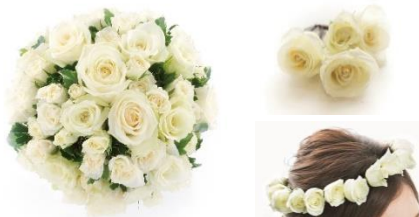
White Rose Round (WB-23) $490 Head Piece $125 Haku Lei $250