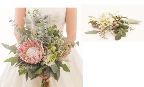
Stylish Resort (HB-42) $465 Head Piece $140 Haku Lei $265