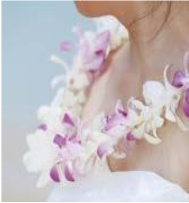
Orchid Lei Pink & White --- $40