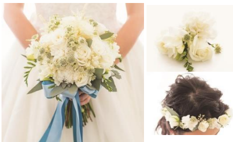
Green Mix & White Clutch (HB-39) $515 Head Piece $140 Haku Lei $265