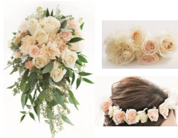
Peach Rose Natural Cascade (WB-28) $475 Head Piece $125 Haku Lei $250