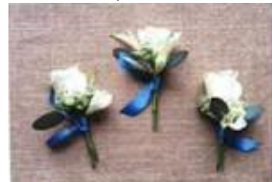
Groom's man Boutonniere $25 Matching color for bride's bouquet ※Must purchase upgrade Bouquet