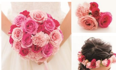
Sweet Harmony (HB-44) $440 Head Piece $115 Haku Lei $265