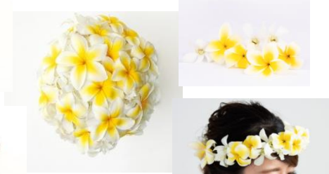
Yellow Plumeria Round (HB-21) $505 April – August ONLY Head Piece $130 Haku Lei $265