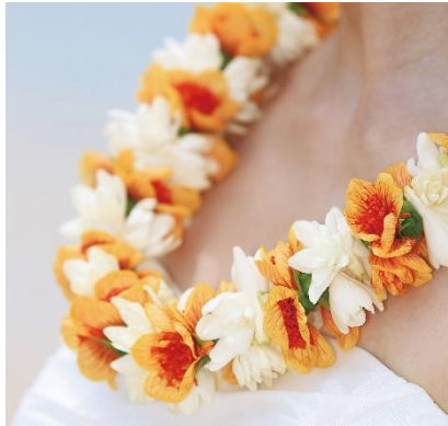
Tuberose & Ilima --- $80