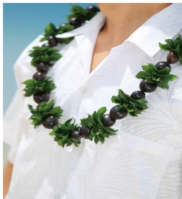
Kukui (Mock) --- $80