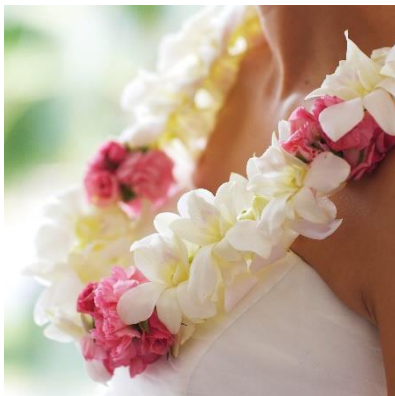
Lovely --- $80