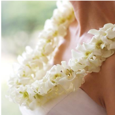
Orchid Lei Double White --- $80