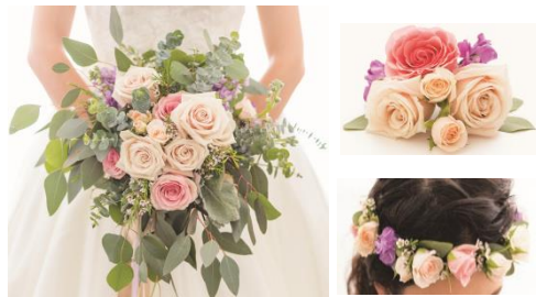
Natural Rustic (HB-46) $465 Head Piece $175 Haku Lei $265