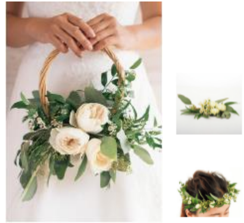
Wreath of Garden (HB-55) $490 Head Piece $140 Haku Lei $265