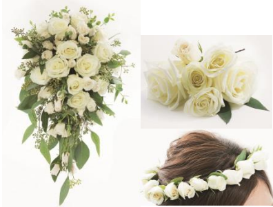
White Rose Natural Cascade (WB-27) $440 Head Piece $125 Haku Lei $250