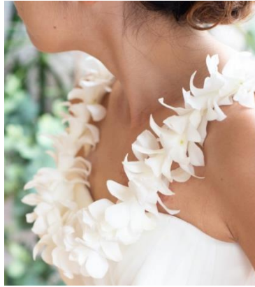
Orchid Lei White --- $40