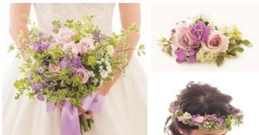
Lavender Garden (HB-45) $450 Head Piece $115 Haku Lei $265