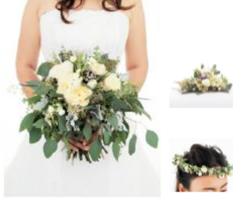
Garden Rose & Silver leaf Clutch (HB-53) $715 Head Piece $175 Haku Lei $265