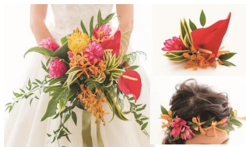
Romantic Tropical (HB-47) $490 Head Piece $175 Haku Lei $265