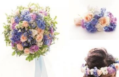
Pastel Blue Round (WB-18) $490 Head Piece $155 Haku Lei $250