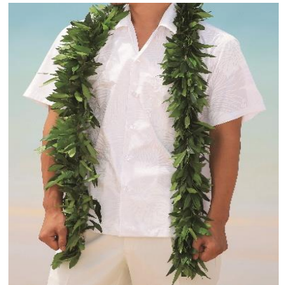
Maile Lei --- $115