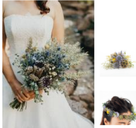
Blooming Forest (HB-54) $630 Head Piece $140 Haku Lei $265