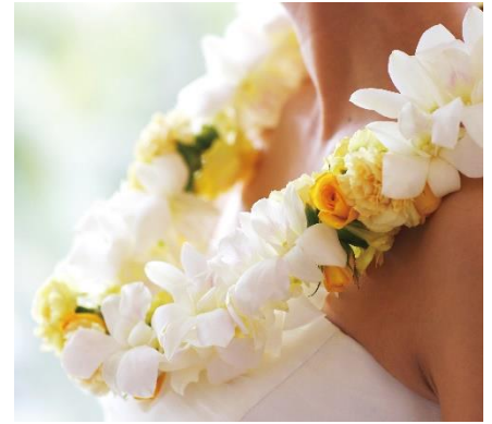
Stylish --- $80