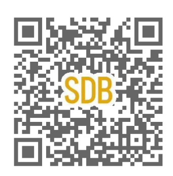
Saison de Brides by Watabe Wedding Website